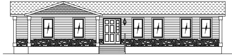
SAMPLE FRONT ELEVATION

**TRIPLE M HOUSING LTD. HAS AN UNSURPASSED COMMITMENT TO PRODUCT QUALITY AND INNOVATION. IN ORDER TO MEET MARKET DEMANDS TRIPLE M RESERVES THE RIGHT TO MODIFY PLANS AND/OR SPECIFICATIONS AT ANY TIME WITHOUT NOTICE. DUE TO PROVINCIAL, STATE AND/OR OTHER DESIGN REQUIREMENTS SOME VARIANCE IN STANDARD FEATURES MAY OCCUR. **SOME ITEMS SHOWN MAY BE OPTIONAL.