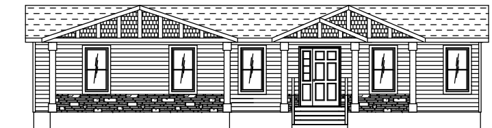
SAMPLE FRONT ELEVATION